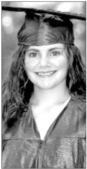
Summer Booker Class of 2007