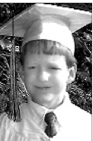
Xander Pasoley Kindergarten