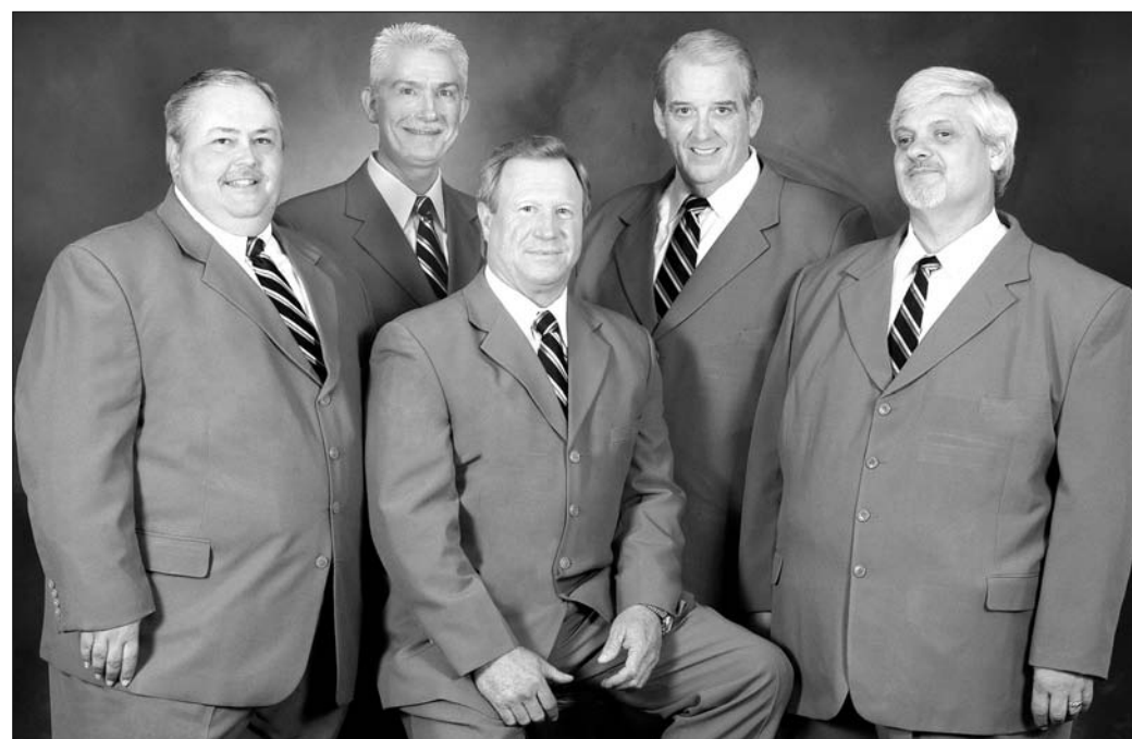
Crimson City ... will be in concert at SCHS Football Field on Friday, June 1