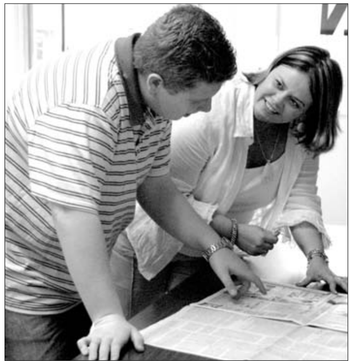
Choctaw Sun photo by Marcus Gates