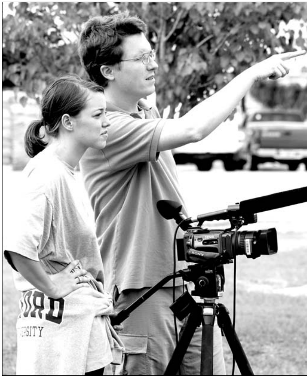
Choctaw Sun photo by Dee Ann Campbell