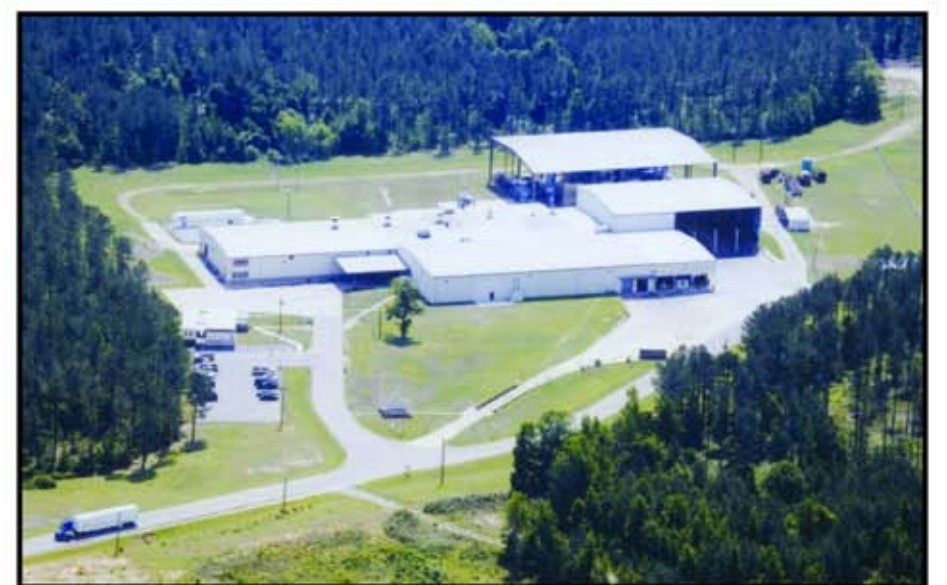
The TAMKO Butler facility is over 100,000 square feet on 150-acres of property. The plant employs approximately 30 workers.