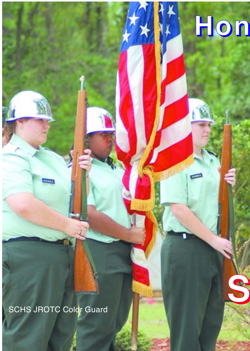
SCHA JROTC Color Guard