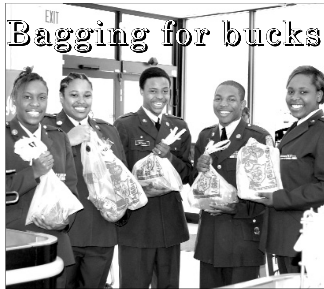
Bagging for bucks BUTLER — The JROTC unit from Choctaw County High School participated in a Bag-a-thon at Piggly Wiggly in Butler last Saturday. The event not only gave the cadets the opportunity to raise funds for their unit, but also allowed them to make their unit more visible within the community. A total of 124 cadets are part of the CCHS JROTC.