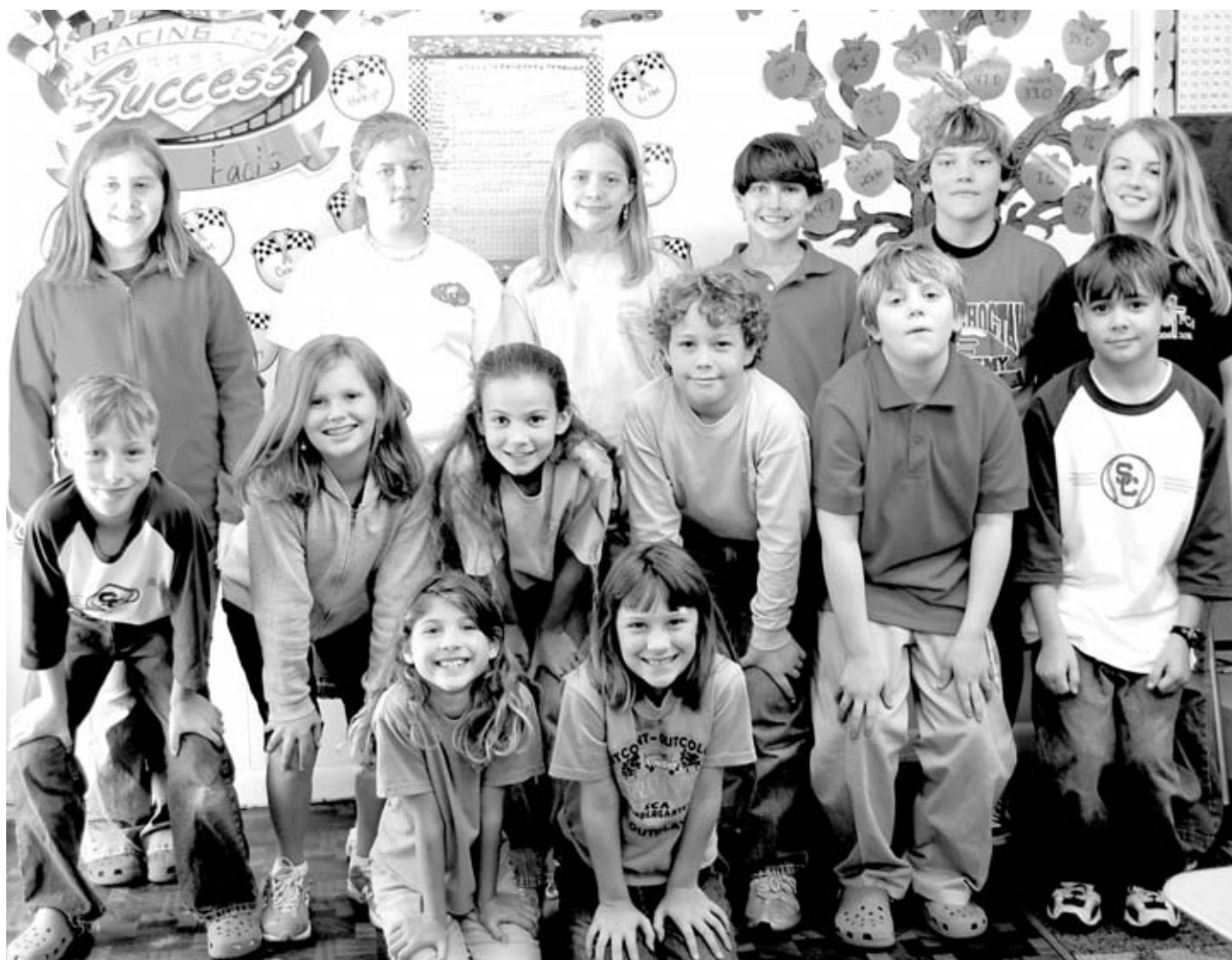
Choctaw Sun photo by Dee Ann Campbell