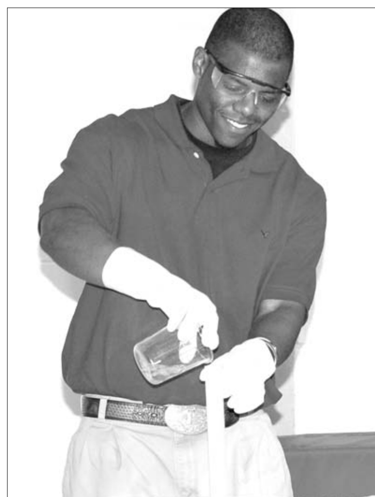
In a tribute to famous African-Americans, SCHS students demonstrated the accomplishments of such historical figures as George Washington Carver.