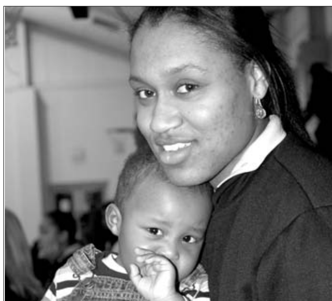
AT LEFT: The audience at CCHS included young and old alike, from parents to friends to local officials.