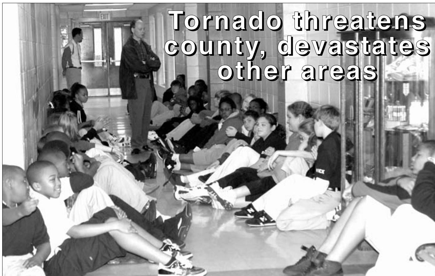
These students at Southern Choctaw Elementary took their places in the hallway during a tornado warning that was issued for the southern portion of the county about 1:45 on Thursday.