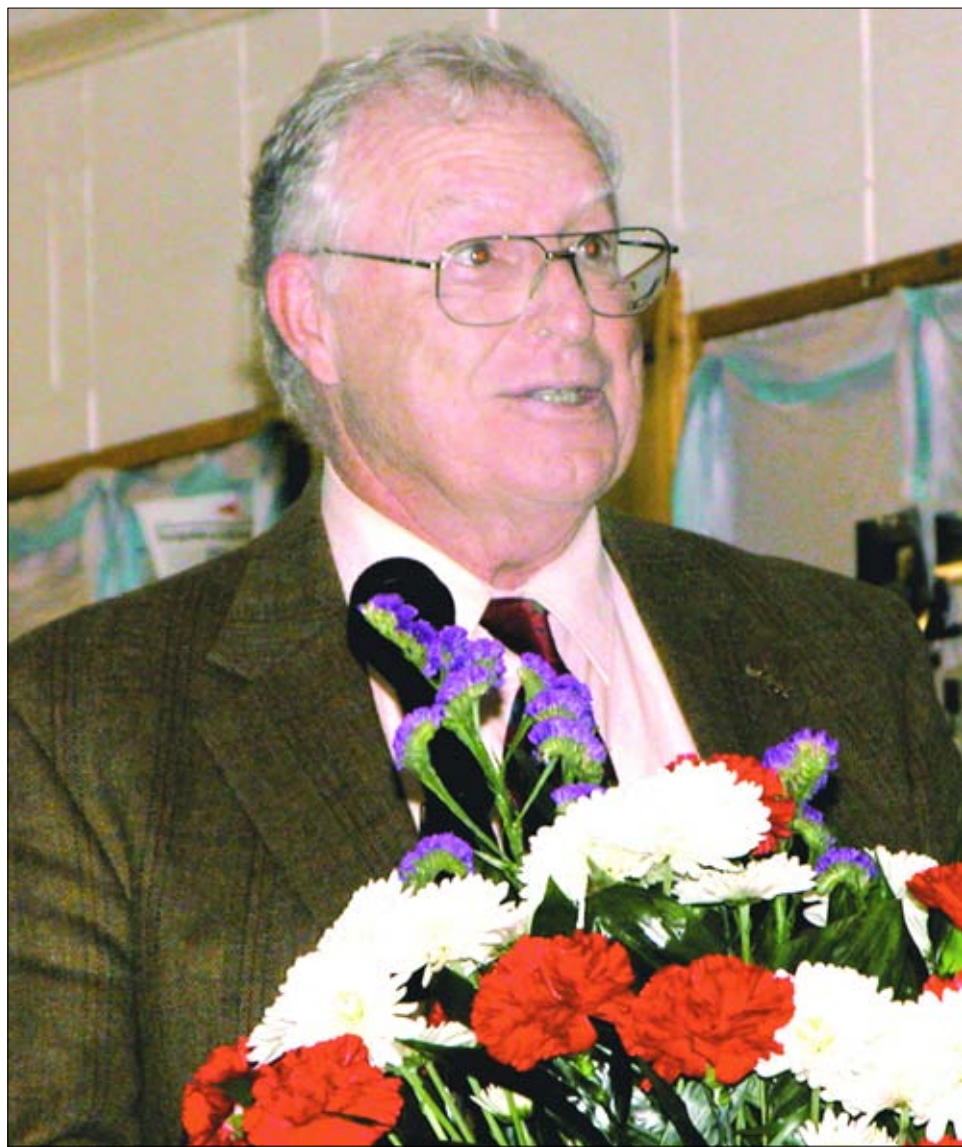
Choctaw Sun photo by Dan Melvin