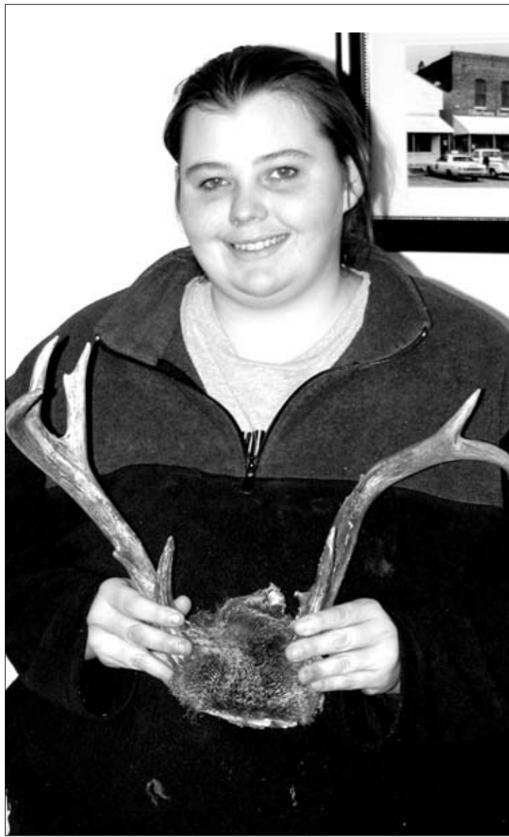
Choctaw Sun photo by Tommy Campbell