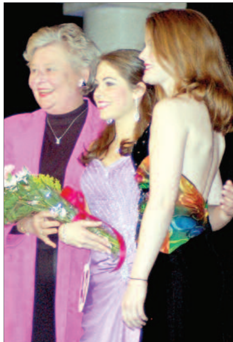
Choctaw Sun photo by Dee Ann Campbell