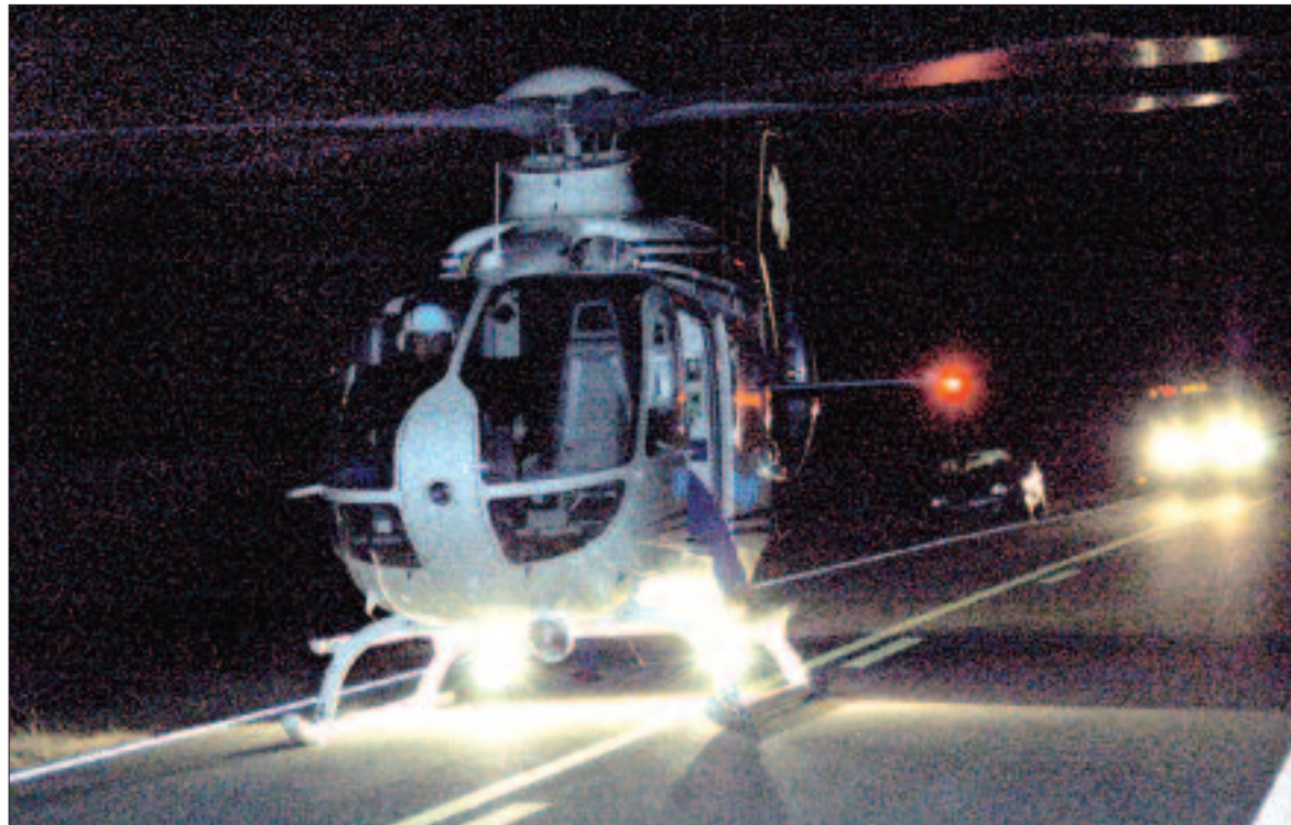
A Life-Flight helicopter prepares to take off from CR 3, near Aquilla, after landing just yards from the scene of a crash in which Derrick Sullivan was entrapped for approximately two hours.